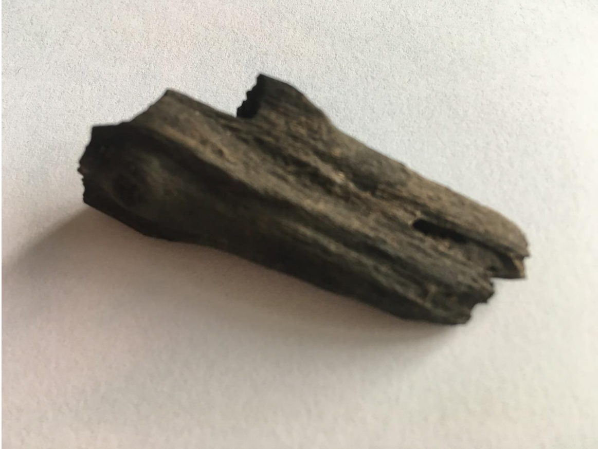
Tony Spillane 8 th July 2019